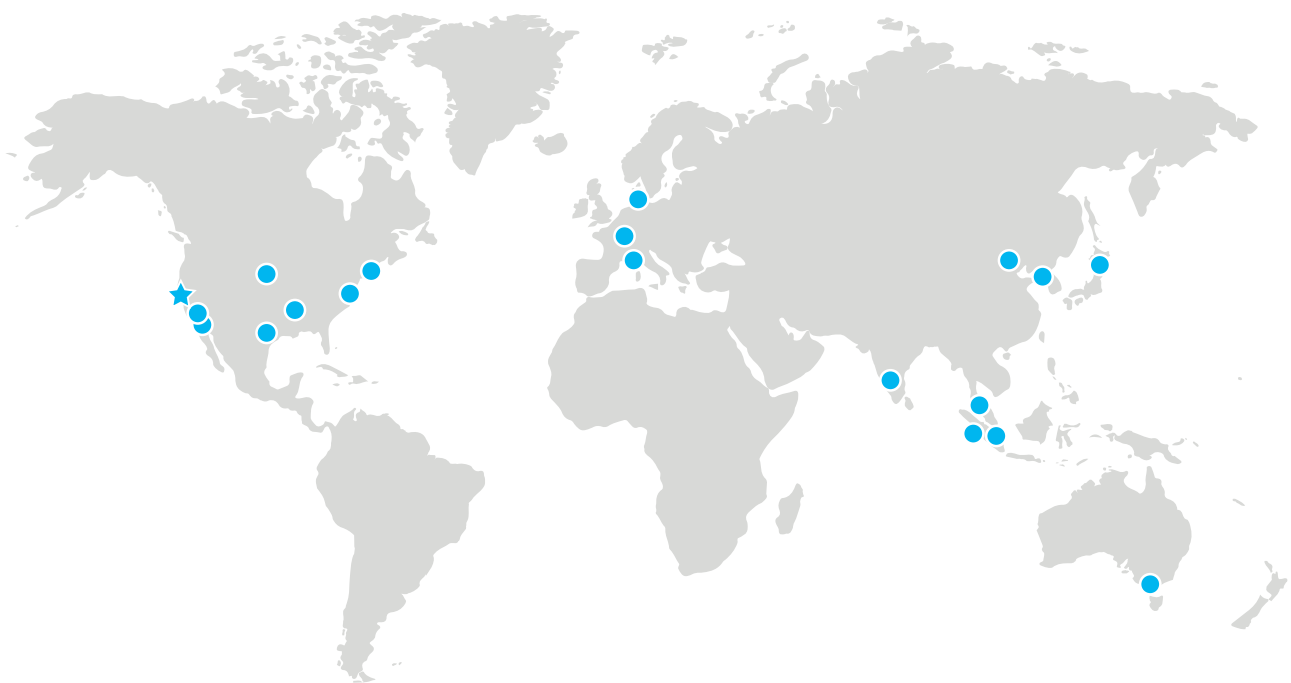
● = Major sites and logistics centers

Agilent's culture is based on innovation; trust, respect and teamwork; and uncompromising integrity. Added to these are speed, focus and accountability to meet customer needs and create a culture of performance that draws on the full range of people's skills and aspirations. Agilent is regularly recognized by external organizations for its culture as well as its practices around processes and people.