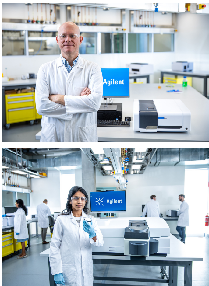
Figure 1. Agilent UV-Vis spectrophotometers used for color measurements include the Agilent Cary 60 UV-Vis spectrophotometer (top) and Agilent Cary 5000 UV-Vis-NIR spectrophotometer with an external diffuse reflectance accessory (DRA) (bottom).

Agilent offers a range of instruments for color measurements that cover liquid and solid sample types. The Agilent Cary 60 UV-Vis and Cary 5000 UV-Vis-NIR spectrophotometers are shown in Figure 1 and a full list of instruments is provided in Table 1. These Cary instruments, which are controlled by Agilent Cary WinUV software for UV-Vis or UV-Vis-NIR, address a variety of analytical needs, e.g., high throughput, ease of use, and sample accessibility.